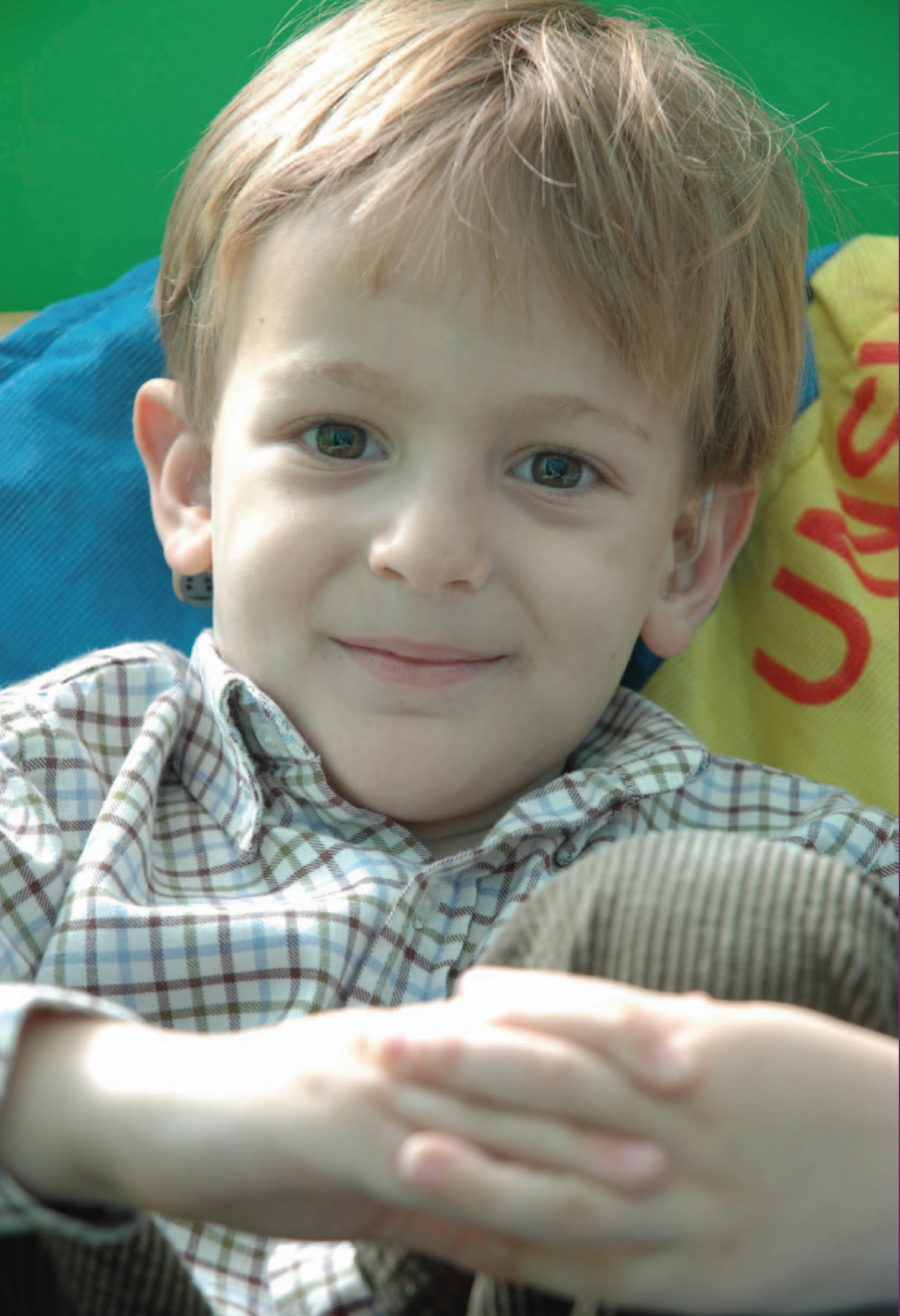
In the Test Booth: The Hearing Test